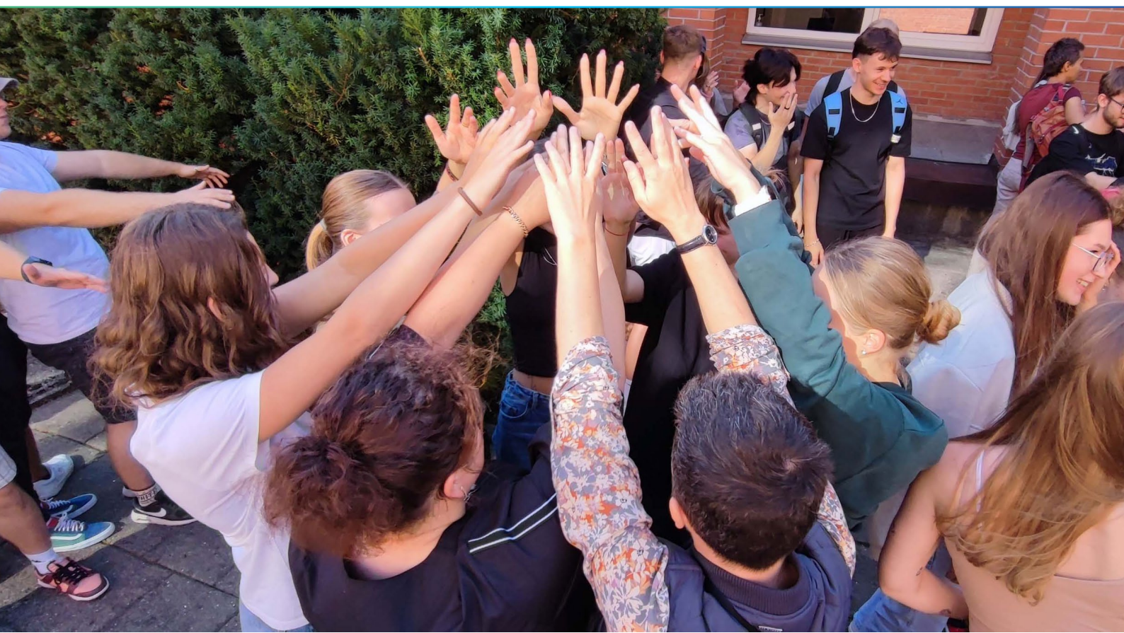
Photo shows a snapshot of the SPF-organised World Physiotherapy Day (08/09/2024).