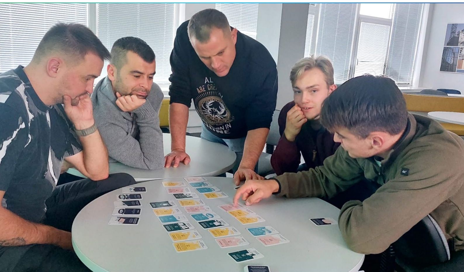
Photo shows STF students tackling climate challenges.