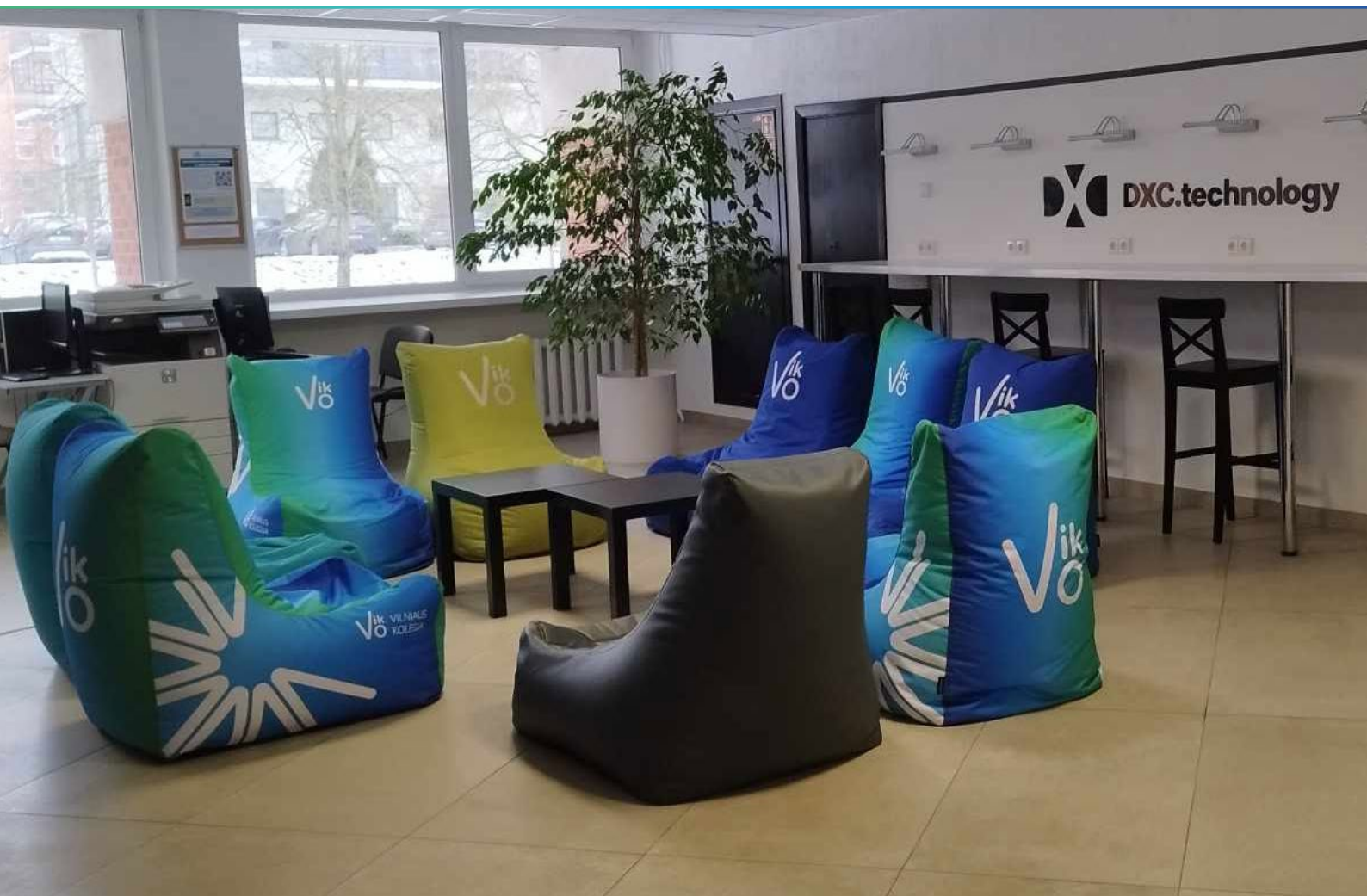
Photo: DXC.technology installed space in the VVF.