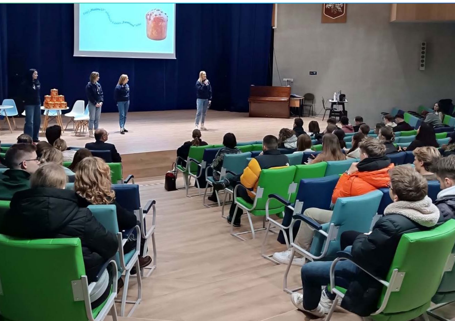
Photo: World Entrepreneurship Week celebrated by the WEF on 18 to 22 November 2024.

In summary, Vilniaus kolegija/HEI aims to disseminate social responsibility and sustainable development to the public and the VIKO community through openly accessible public lectures and seminars, trainings, public events, scientific conferences, forums, roundtables, and initiatives aimed at disseminating the ideas of social responsibility and sustainable development.