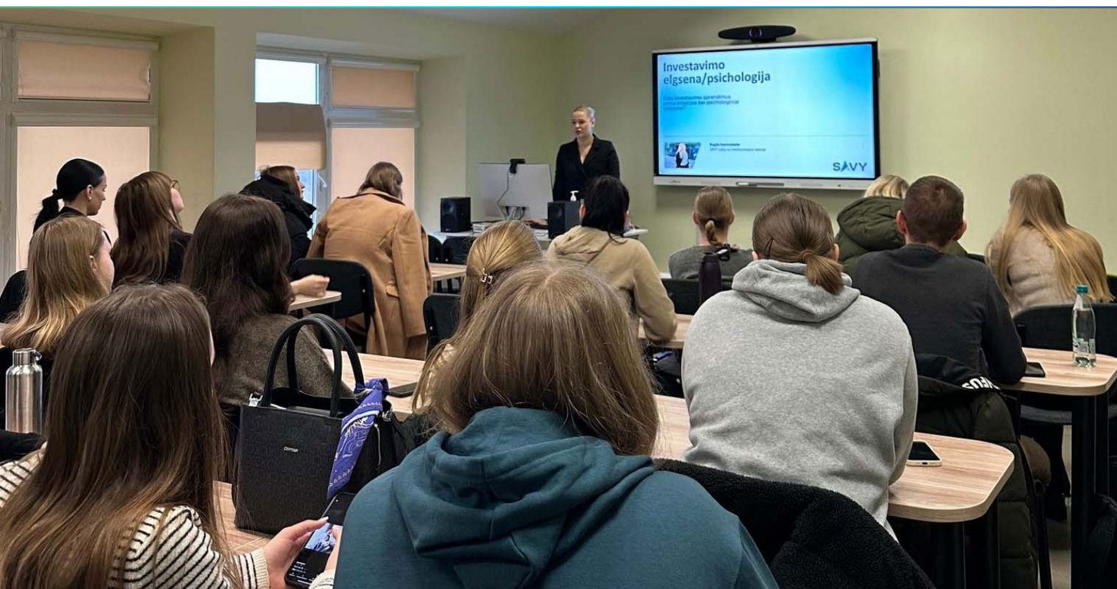
Photo shows lectures by guest lecturers.