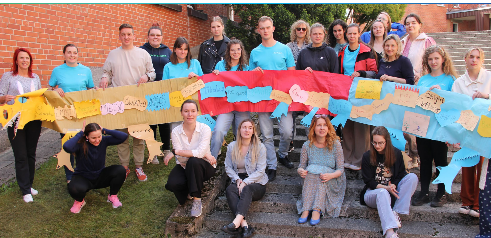
Photo: The snapshot of BIP "ACTION 1.0" held at the SPF from 13 to 17 May 2024.

social enterprise project, deepened their understanding of the principles and practices of inclusive innovation, and acquired knowledge and skills to design, establish, and improve social enterprises and increase their sustainable impact on society. This modern shift is a response to imminent global challenges such as inequality, poverty and environmental sustainability, requiring innovative solutions that not only boost economic growth but also social well-being. At the end of the course, the idea presentation event was held, which added meaningful change to the creation of a more sustainable world), but also through various events and competitions , such as Misconceptions or cre-