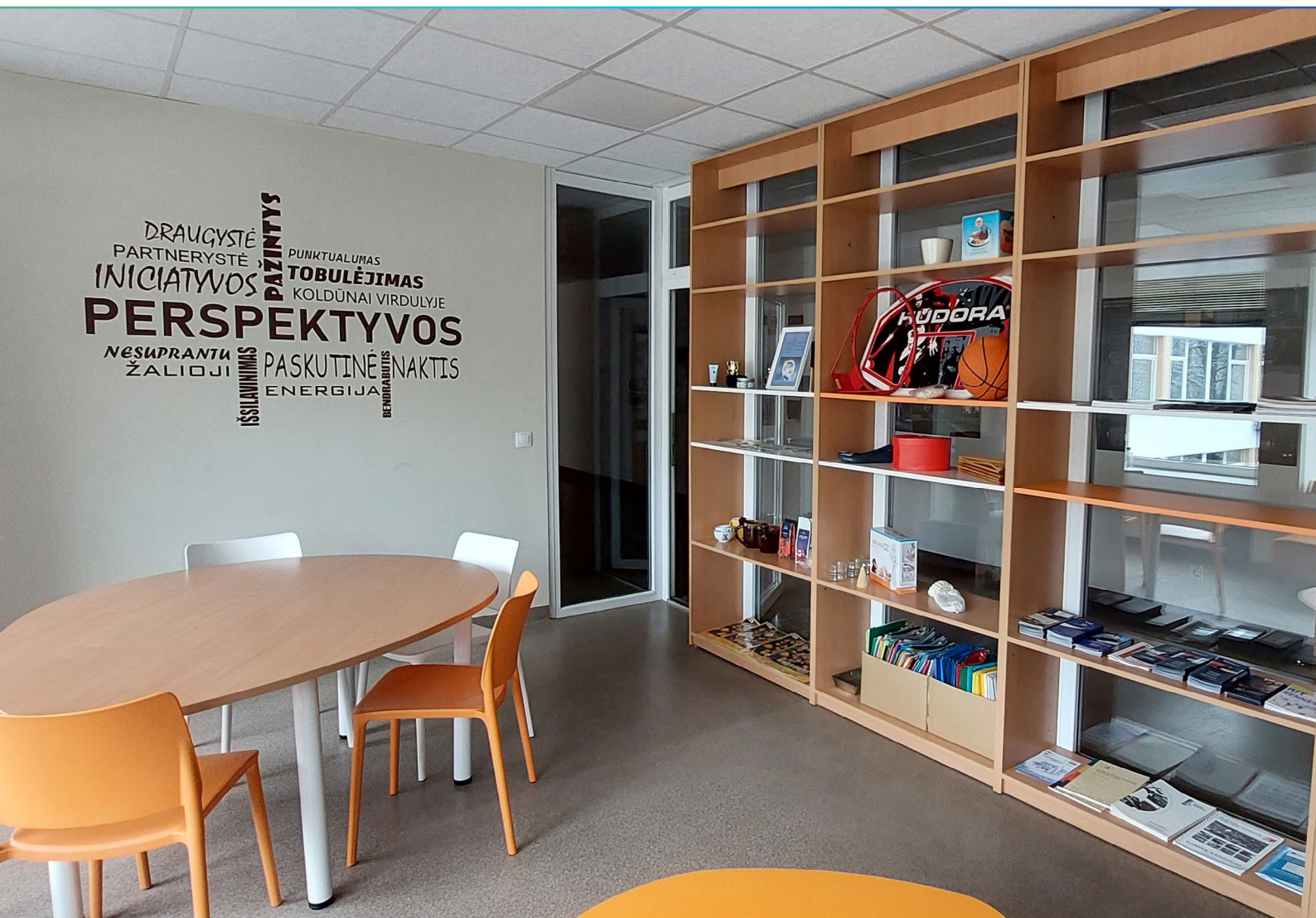
Photo shows the STF's item drop-off shop.