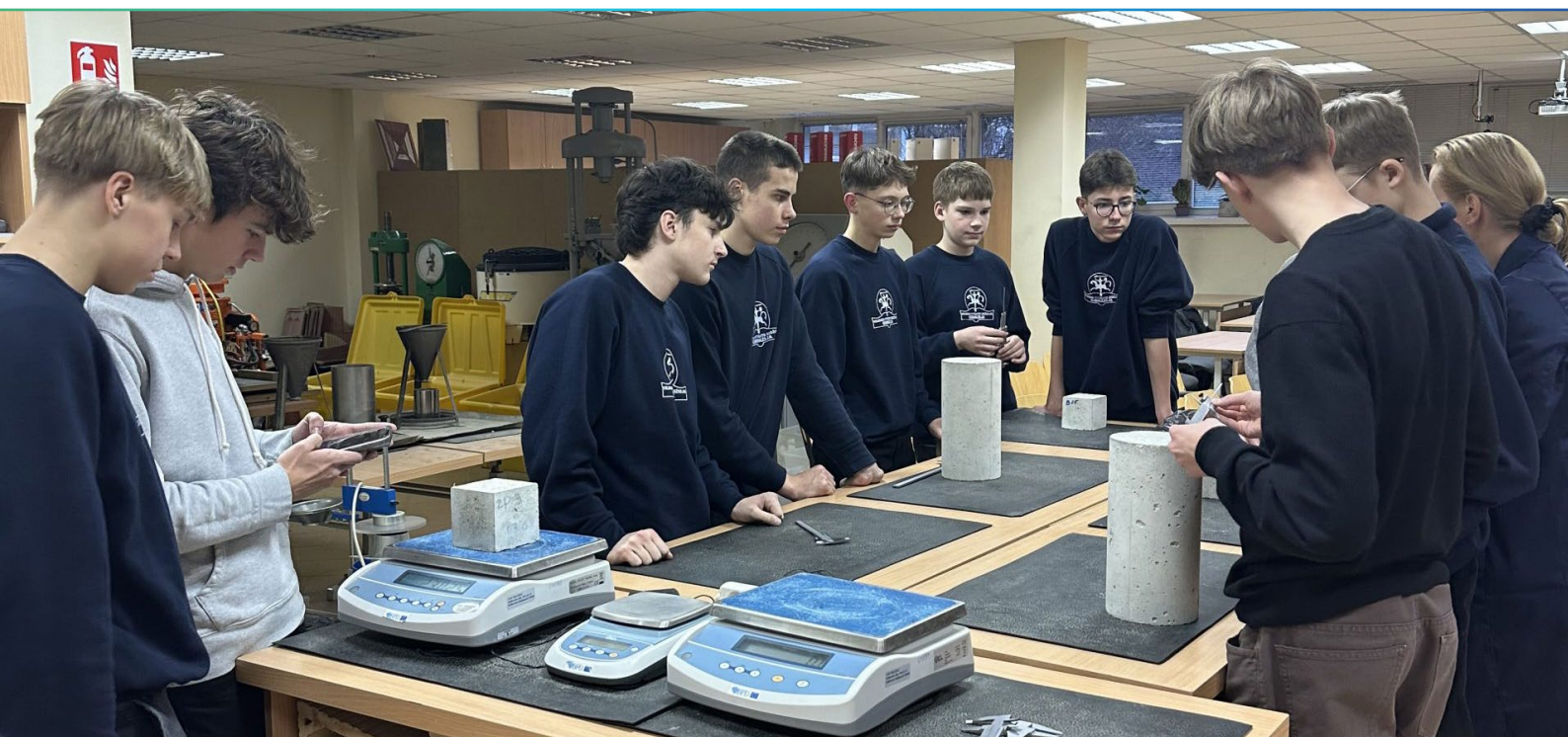
Photo: visit of the Vytautas Magnus Gymnasium I grade students to STF (12/12/2024).

In summary, social partnerships are a win-win situation for higher education institutions and collaborating organisations, and the VIKO community plans to continue expanding partnerships with a wide range of organisations in the future, to foster innovation and to actively involve students in real-world problem solving through hands-on projects. It also plans to focus more on tackling regional social problems through strategic partnerships.