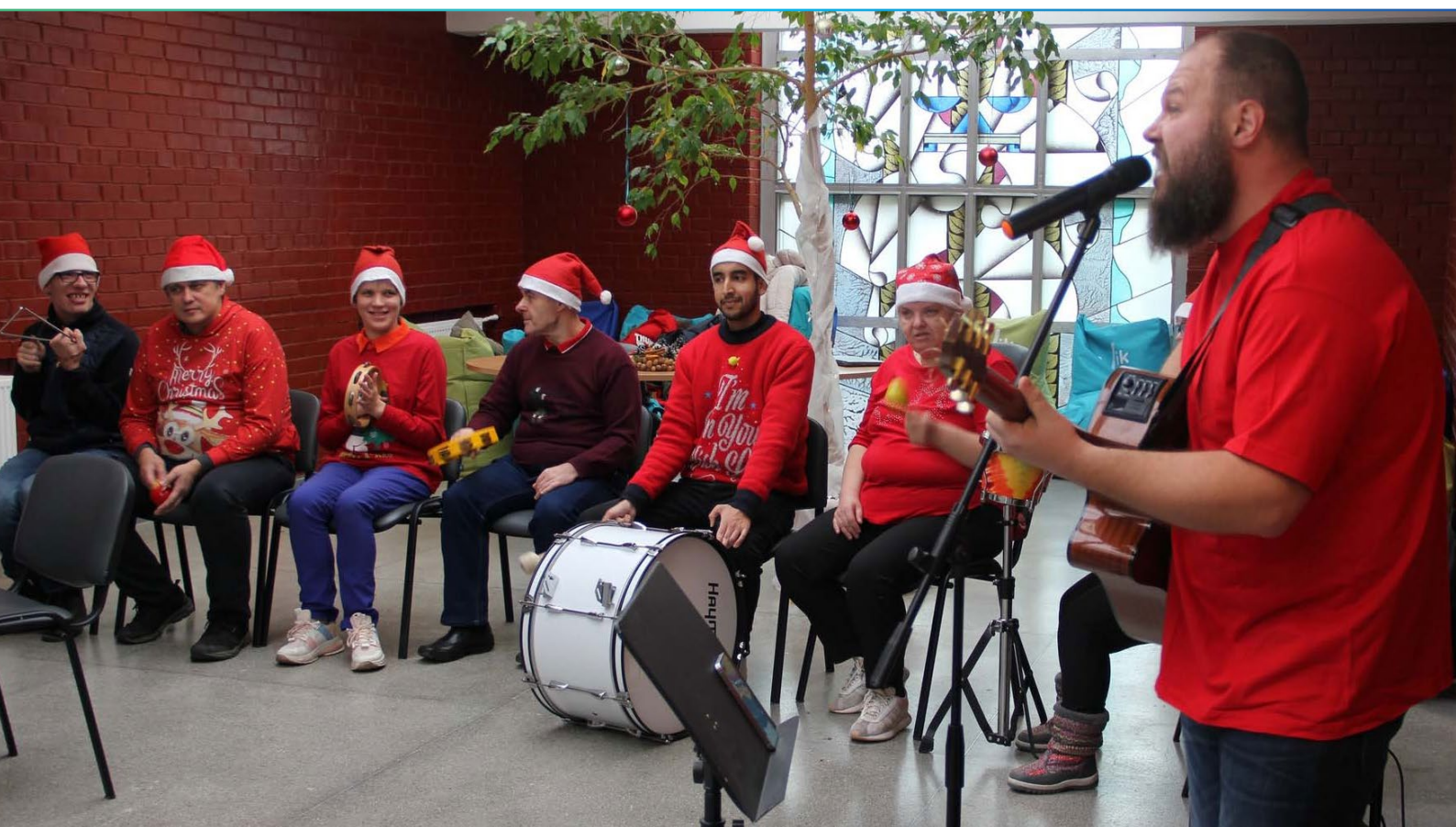
Christmas fair for the visitors of the day care centre "Šviesa" and a concert of their band "Kalėdinis Rock Band".